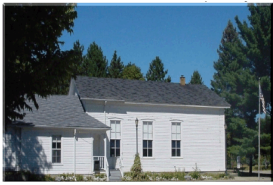
The Jewel Of Macomb County Ray Township