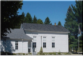
The Jewel Of Macomb County Ray Township