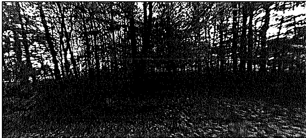
View of Property from Kunstman Road (looking east)

The property located at 60300 Kunstman Road, between 27 Mile and 28 Mile Roads, is zoned R-1, Agricultural Residential. It is currently being developed with a single-family home, which is set back approximately 212 feet from the centerline of Kunstman Road.