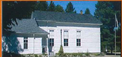
The Jewel of Macomb County Ray Township